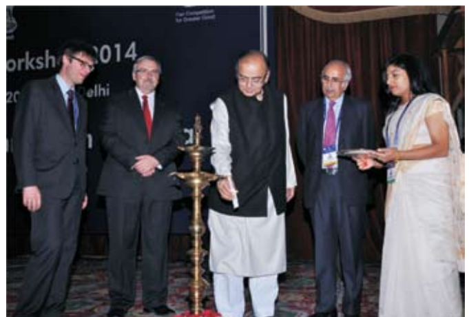
Hon'ble Union Minister for Finance, Corporate affairs and Information and Broadcasting, Shri Arun Jaitley, inaugurating the International Competition Network Merger Workshop.

CCI Workshop on Merger: The International Competition Network Merger Workshop organised by Competition Commission of India (CCI) during December 1-2, 2014 at New Delhi was inaugurated by Shri Arun Jaitley, Hon'ble Union Minister for Finance, Corporate Affairs and Information & Broadcasting. The workshop took stock of the extant mechanism for international cooperation between competition agencies in merger enforcement. "Building an effective framework for international cooperation in the areas of merger remedies" was deliberated extensively. The Minister also released the book entitled "Competition Tracker", a compilation of Orders of CCI, on this occasion.